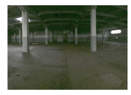
The Fenix Loods before the IABR-2016.

The IABR-2016 opens in April and will provide a rich program of events focusing on the relationships between spatial design and tomorrow's economic changes. It will offer a platform for discussion on the city that we want, advocating for a city that runs on clean energy, inclusive and productive – a city that centers on the public domain and on a solid social agenda.