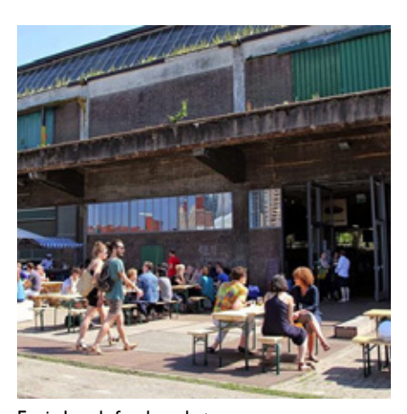
Fenix Loods food market.